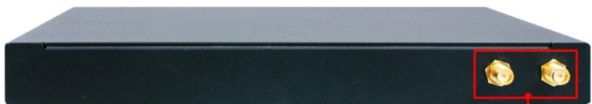
Wifi / 4G Antenna